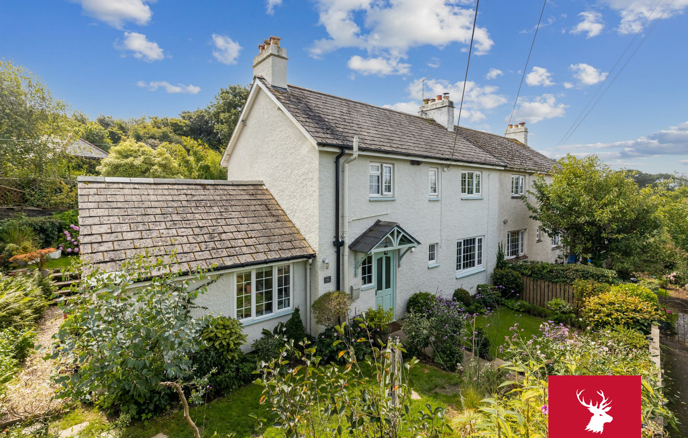
1 Little Meadow Cottages